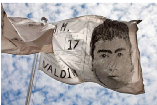
V.R.C: La bandera del sospechoso, 2009

The work consists of a flag, whose image is the portrait of a young defendant (initials: VRC), using the drawing program Identikit (device used by police for developing sketches of possible suspects).