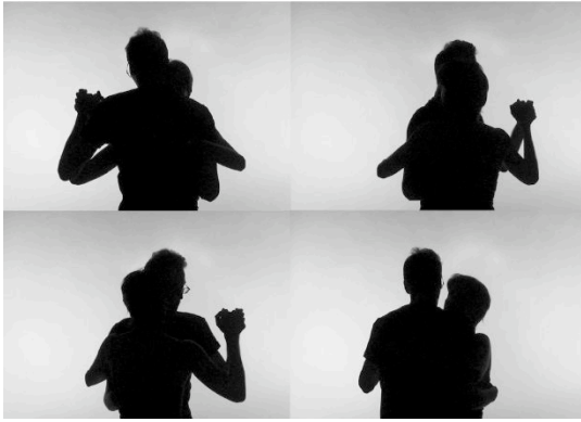
It's not about time, 2012

A handicapped man and a woman are dancing together. A clock ticking next to the projection makes sure that time is present while the title is indicating the absence of it. The pieces of a device scattered around the projection as if just cast into the space reflect the moment before the image.