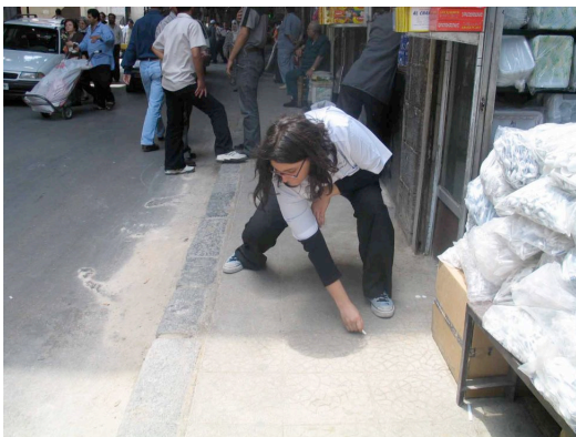
Midhat Bashat Street, 2007

The documentation of a performance that took place in the Midhat Bashat Street, in Damascus, Syria. The artist is marking with chalk on the street the gradually moving shadow of a metal awning located overhead. The action took place from 11.00 to 16.00.