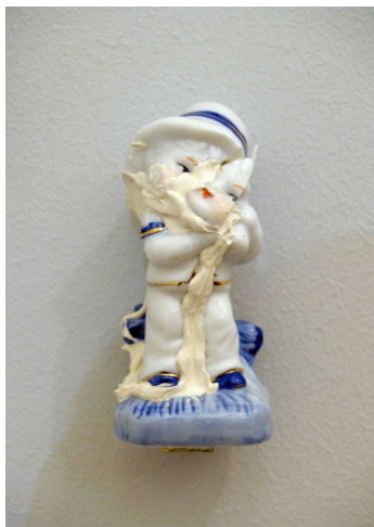
The Miniature, 2011

86 porcelain figures intervened with glue, silicone and duct tape. These porcelain figures have been shattered into hundreds of pieces, reorganized and re-joined using adhesives, silicone and adhesive tapes. The figures are poor quality copies imported from China and distributed to occupy the domestic sphere space. Although decorative and omnipresent, they are carefully taken care of in thousands of homes.