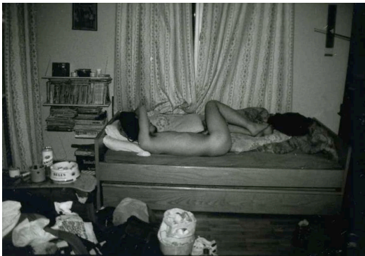
Lost Bodies / Waste and Recycle, 1999 – 2012

An installation of small size photographs and familiar objects that accumulate social agencies in the form of another.