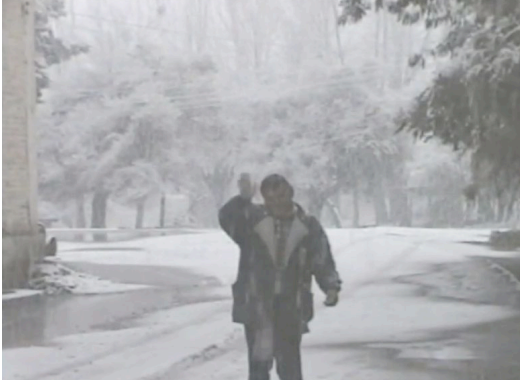
The Rage of the Legless Horses, 2000

The documentary follows the radio workshop RADIO PARADISE STATION, which ran between 1999 and 2000 in the Psychiatric Hospital El Peral in Santiago, Chile. During this period, significant progress was made regarding the disclosure of the public psychiatric system and there was great media exposure on the reality of psychiatric prisoners and their recovery. The radio was never consolidated and no transmission was performed outside the hospital. In 2006 and after several attempts, the radio closed down due to lack of funding.