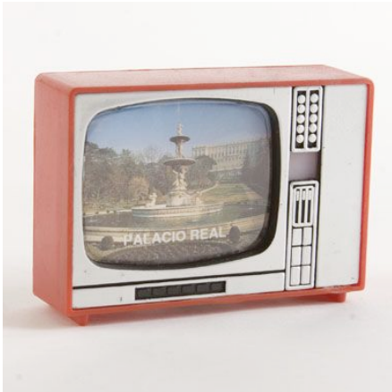
The Found Object, 2007

A color photographic polyptych of decorative objects selected from different homes, removed from their original environments and then isolated in a photo studio. Through this operation the final image carries the original reference of the object, previously lost in its reproduction.