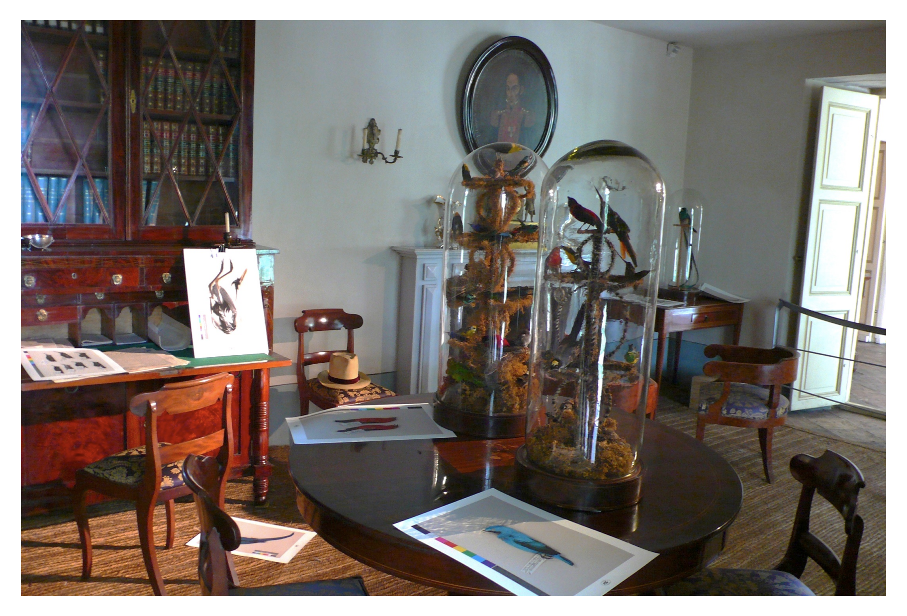
La Fábula de los Pájaros, in Una serie de posibles recuerdos, October 2011. Installation of 8 color photographs 24 de 38 x 50 cms. at one of the rooms at the Museo Casa de Bolívar, with 4 antique object (bell glass) with dissected birds, that belongs to the museum collection.