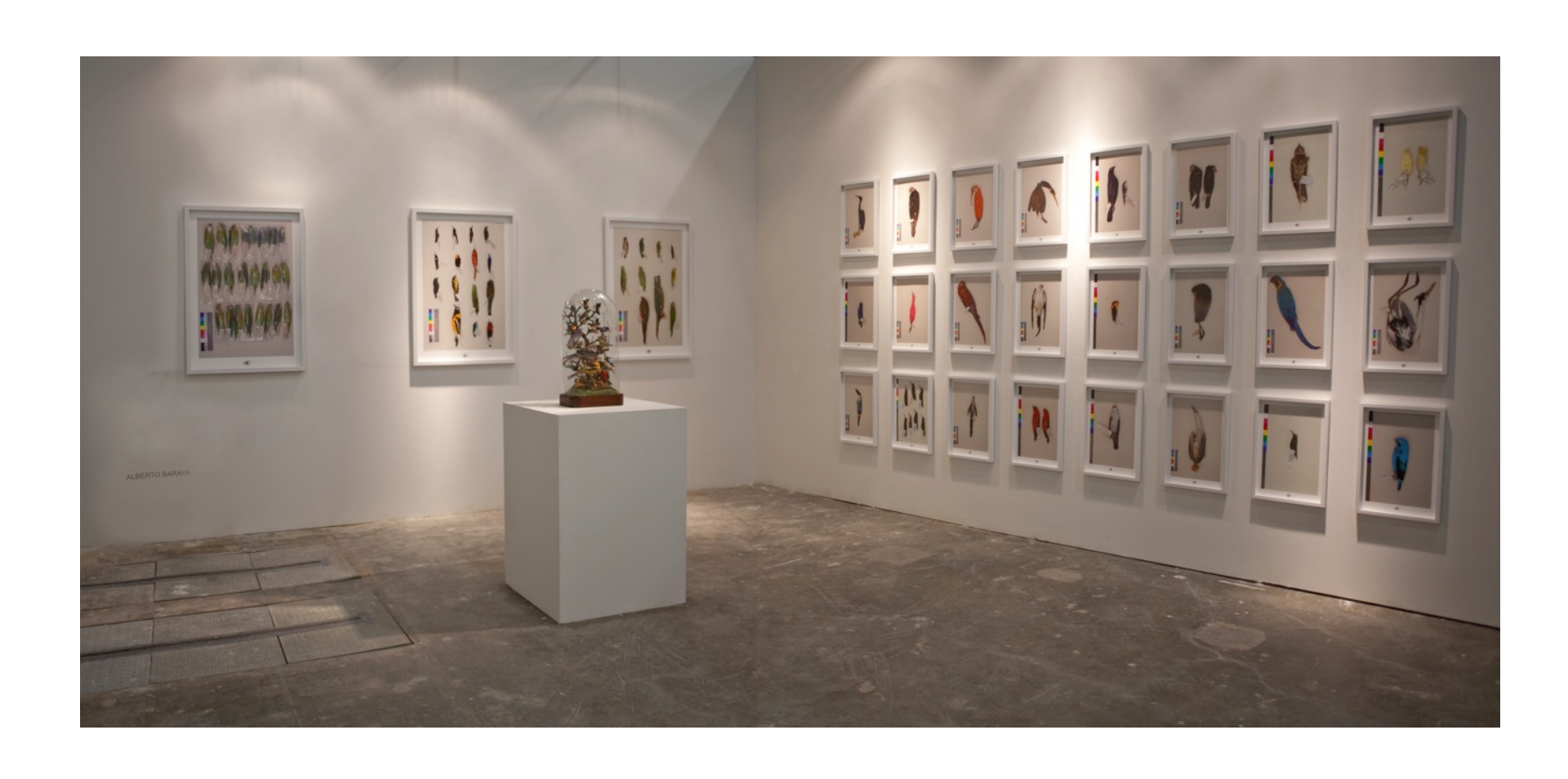
La Fábula de los Pájaros, in Tropical Hangover, Feria ARTBO October 2011. Installation of color photographs from scientific collections. (24 de 38 x 50 cms. and 3 de 116 x 80 cms) and antique object (bell glass) with dissected birds.