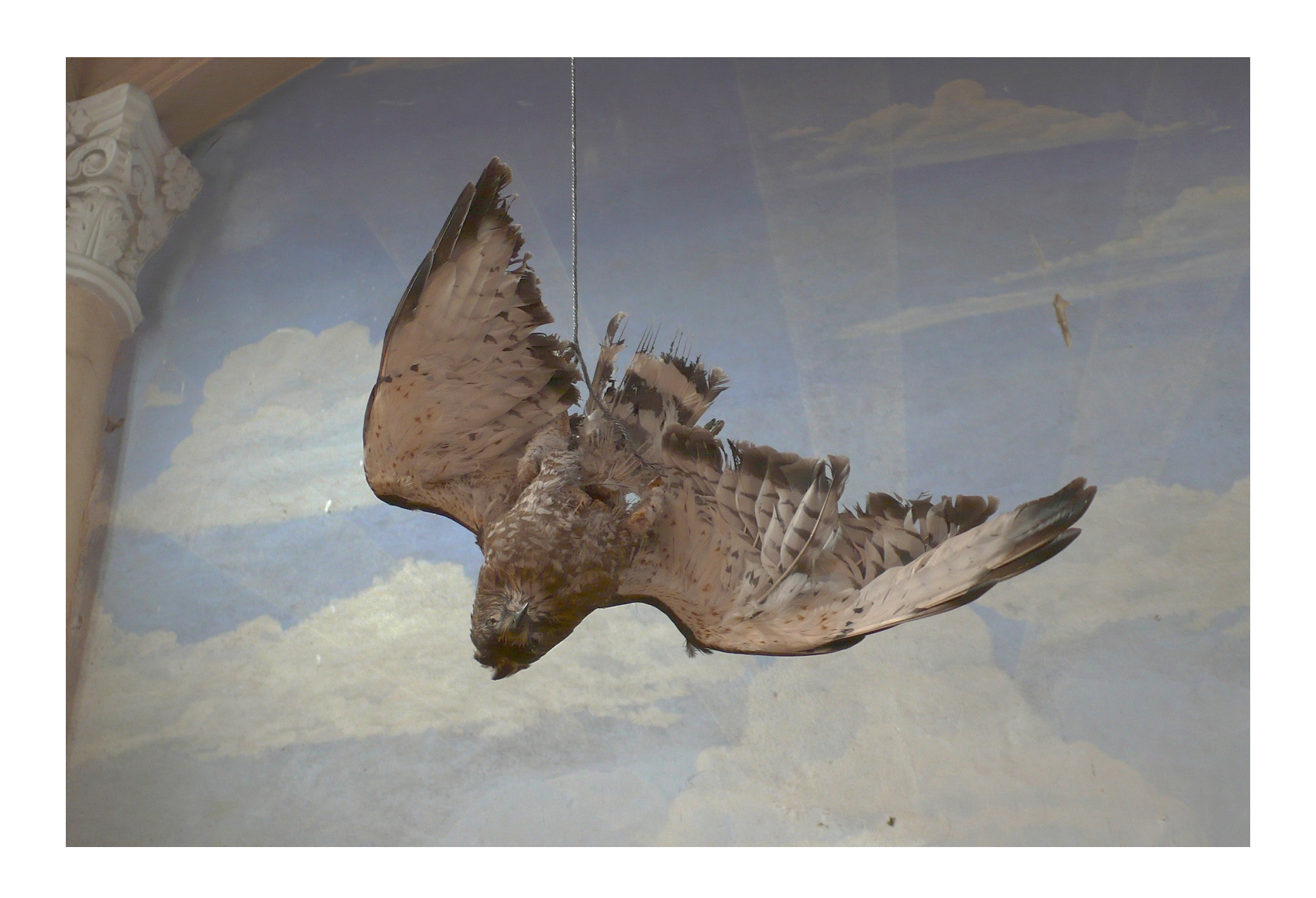
Detail of the intervention at the old chapel of San Vicente de Paul.