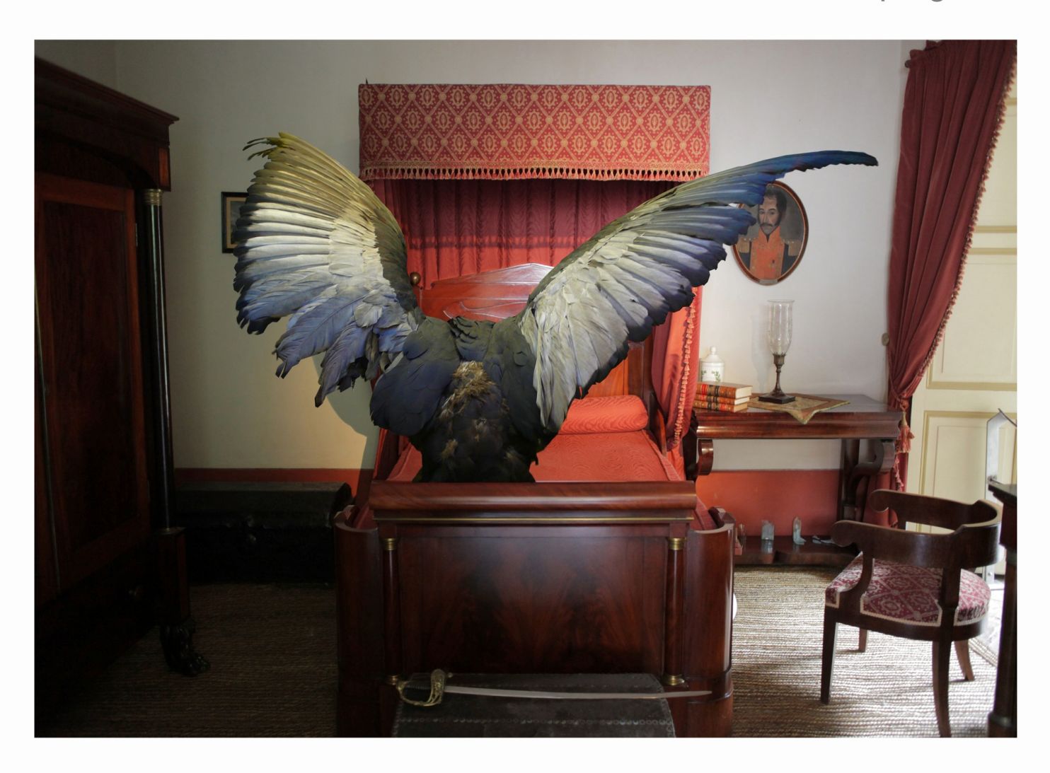
La Fábula de los Pájaros, sketch of an intervention with the dissected specimens from a scientific collection in the Museo Casa Quinta de Bolívar.