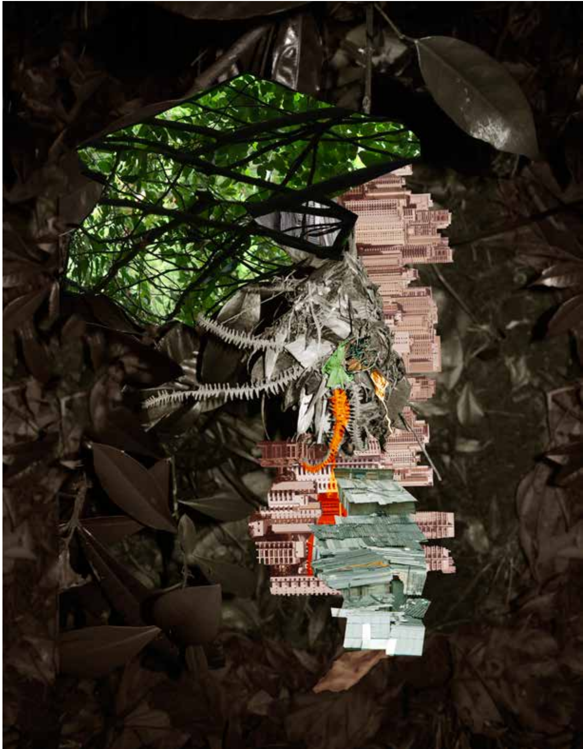
avanhandava , 2015 Inkjet on Hahnemühle paper 55 x 42 cm Edition : 8 + 2AP