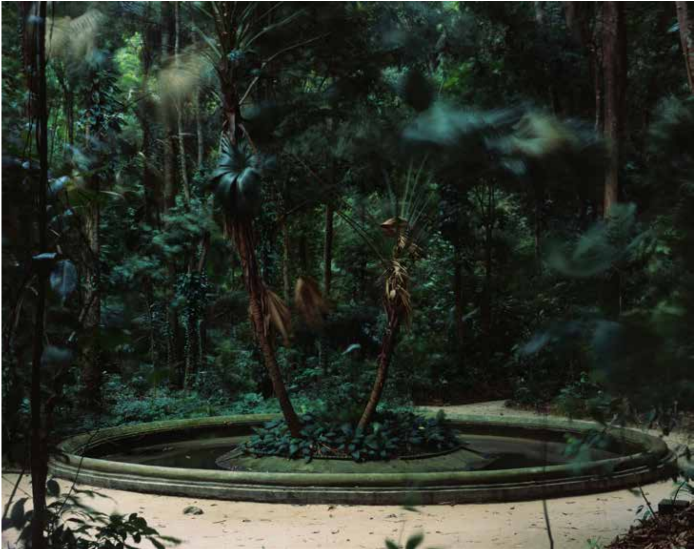
hausverlassung , 2015 C-print on Diasec 180 x 227 cm Edition : 5 + 2AP