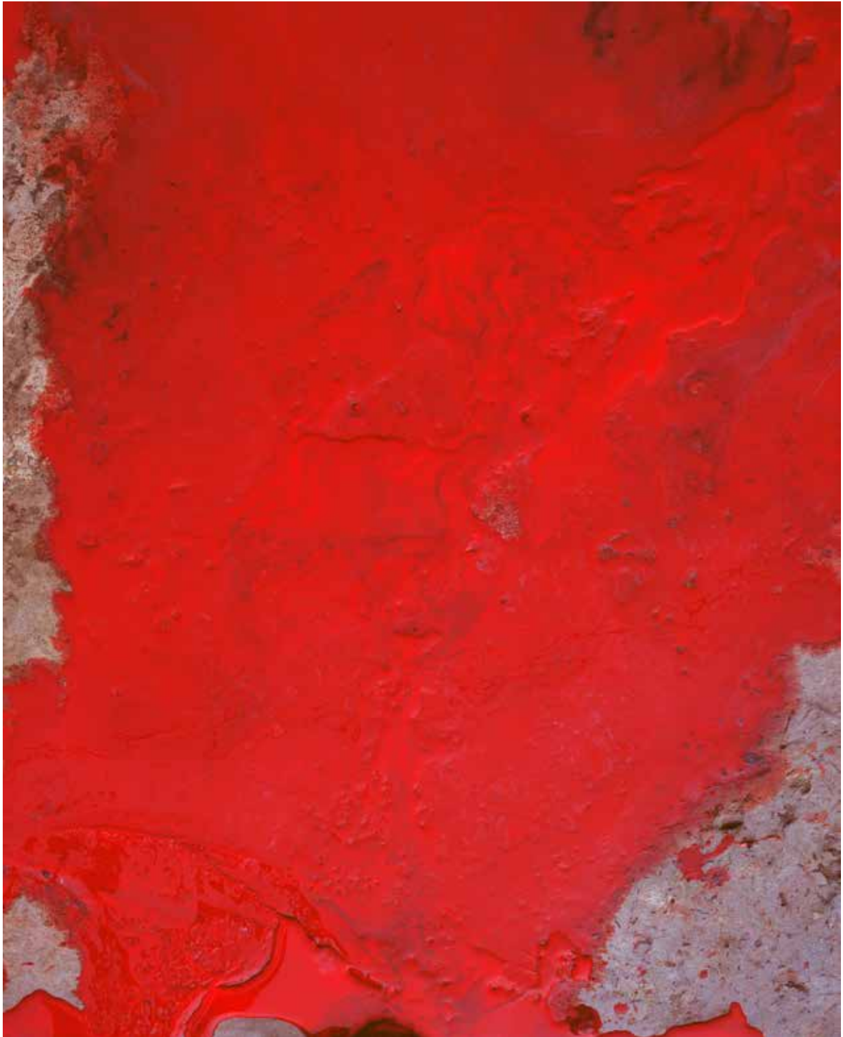
Tupanceretan , 2015 C-print on Diasec 222 X 180 cm Edition : 5 + 2AP