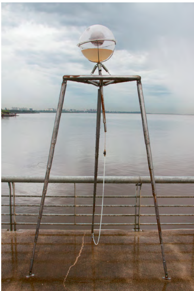
A homeopathy dropper installed at Parque de la Memoria for Eduardo Navarro's project Homeopathic Treatment for the River Plate , 2013–ongoing.

“Número” is, in my view, the most visually appealing component of the “Guide,” which has predominantly featured archival or documentary imagery. This series clearly partakes in and pays homage to a tradition of “wondrous” photography, produced with microscopes, that has existed since the 19th century. On their own, the photographs provide few direct clues as to the context in which they were made and the archive in which they are held. Similar to Keller’s enlarged scans, which invite viewers to dwell on the internal complexity of simple plants, Faivovich & Goldberg’s series emphasizes the diverse components of a seemingly unified rock, revealing that the meteorite consists of a variety of elements, each of a distinct shape, translucency and hue.