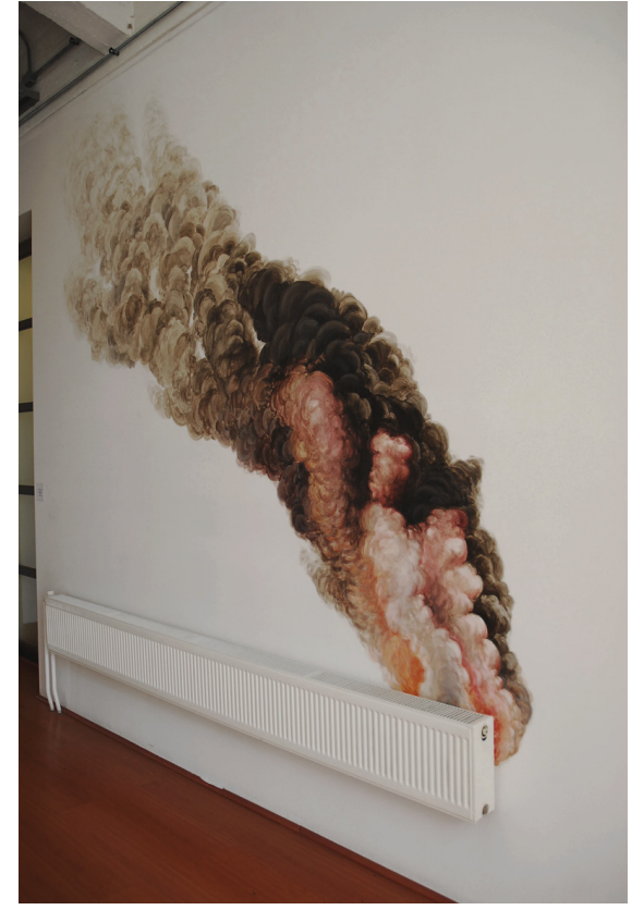
El infierno no termina aquí, details.