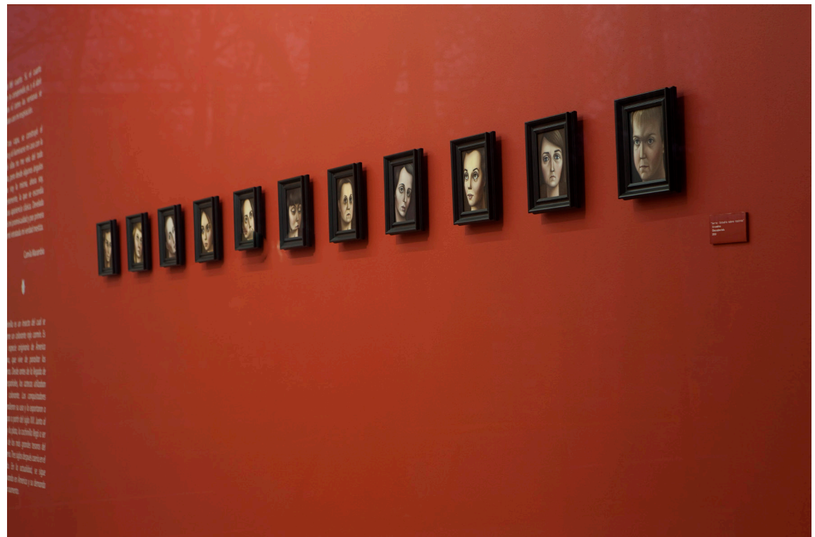
Series Face Studies, detail of the series at the exhibition