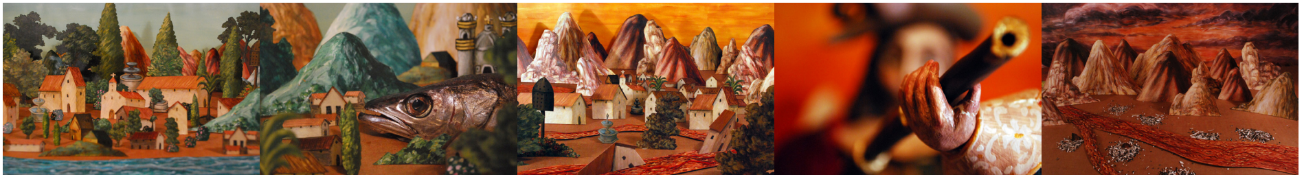
La Diabla Encomienda , in collaboration with Diego Lorenzini. Stop motion animation (work in progress), 2010.

This video is about a musketeer Archangel that tells his own story. As in South American colonial paintings, the narration is expressed by the landscape which reflects the character's emotional states. The video is a contemporary