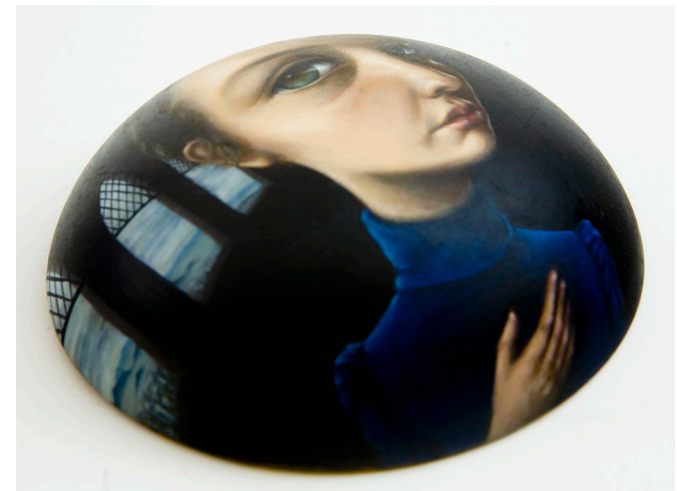
Series: Retratos , oil on convex wood, (17cm diameter and 5cm thickness), Santiago, Chile, 2009.