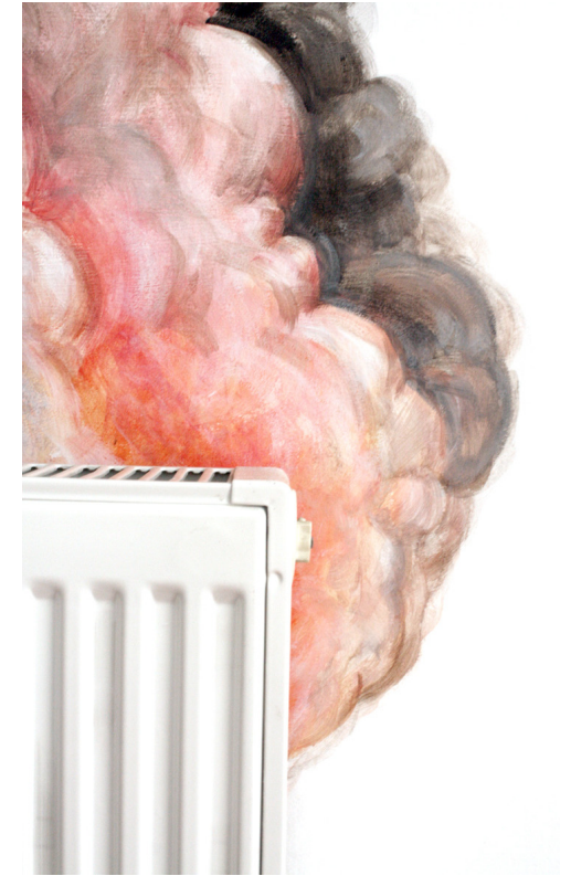
El infierno no termina aquí , wall painting, 2008, Exhibition “Mitos Contemporáneos,” Santiago Library, Chile.

This mural was made on two facing walls. On one of them there was a painting of a huge fire coming from a heater, while the other showed tiny silhouettes of people, planes and helicopters. The painting was opened to multiple interpretations, at first