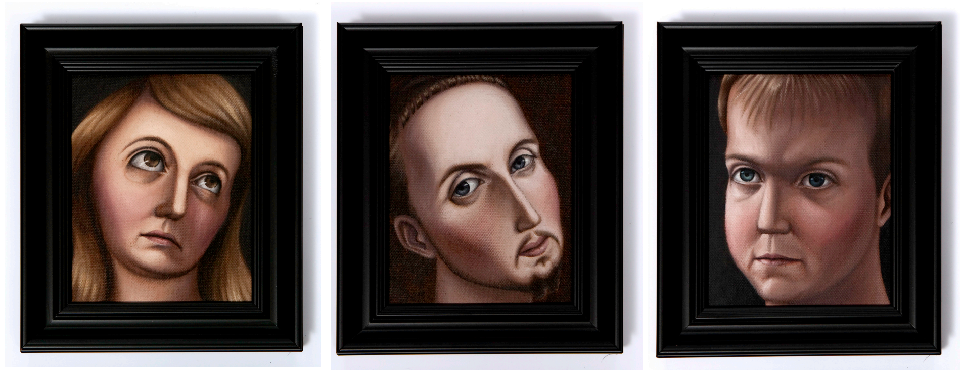
Series Face studies, oil on canvas, (11 pieces of 17cm x 11cm each), details of the series at the exhibition Cochinilla

This series makes direct use of a colonial pictorial language. Faces are distorted and synthesized according to traditional standards of the religious painting produced many centuries ago in Peru, Bolivia and Chile. However, not all about these images is old, while the painting style and technique come