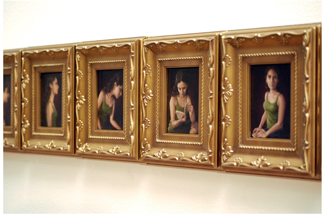
Sequence Carolina details