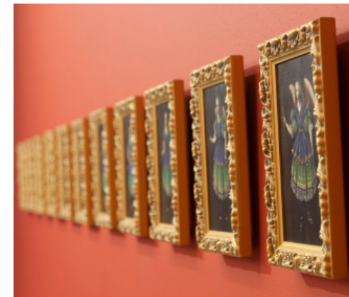
Sequence Doris , oil on canvas, (12 pieces of 20cm x 13cm each). Details of the series at the exhibition Cochinilla

This series depicts the transformation of a girl into a Colonial Archangel in twelve stages. The sitter is portrayed in the series as a contemporary person that becomes a character of the past. This transformation evokes a time travel from the present of the painter to the colonial history. This idea is reflected also by the transformation