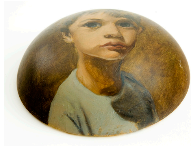
Series: Retratos , oil on convex wood, (17cm diameter and 5cm thickness), Santiago, Chile, 2009.