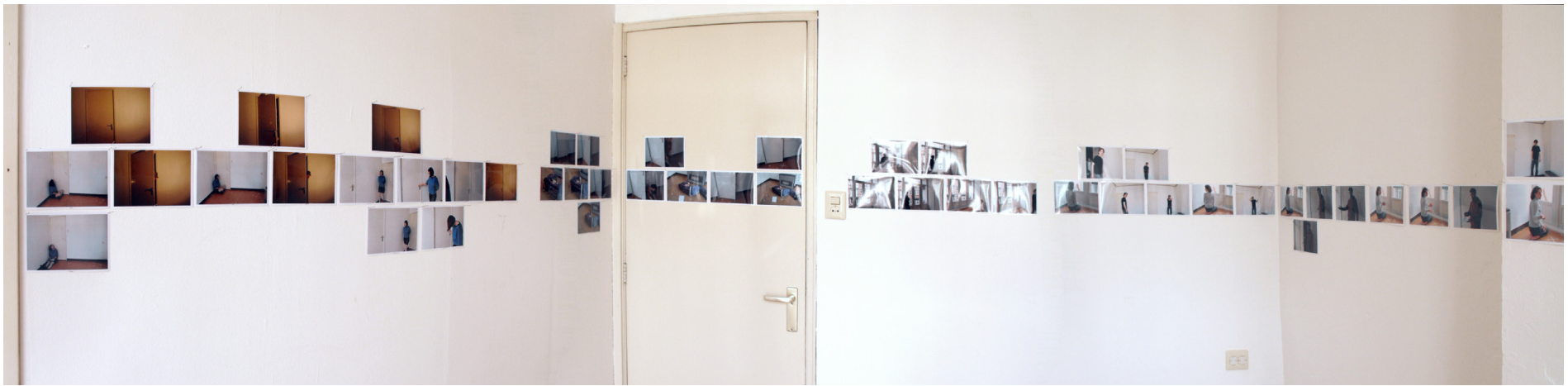
Confinement Room: a story about following instructions , photographic installation, 2011, Guest Room project Space, Rotterdam, The Netherlands.

This series of (15x21cm) photographs narrates the story of a locked person and his/her abductors. In the course of two weeks residency program, the artist developed an strategy to produce the work without being physically there. Random people were invited to participate in the project