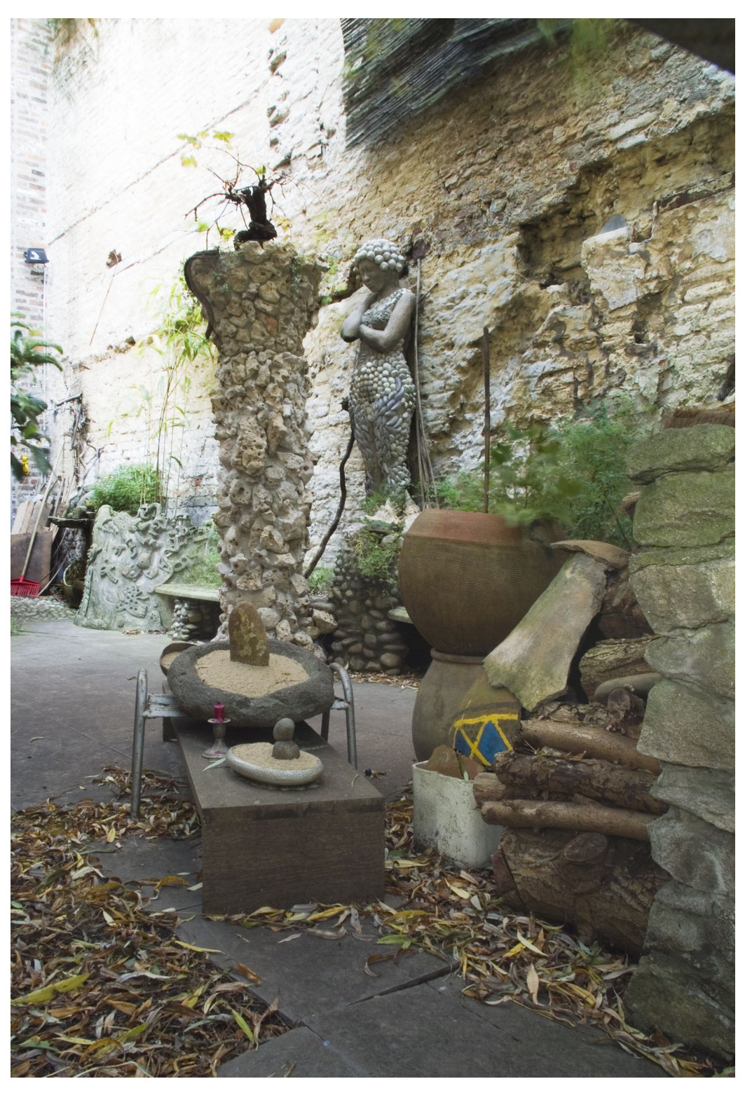
A secret garden for Ghent 2006 Diverse objects in a Zen arrangement Variable dimentions View of the work at private home in Ghent, Belgium