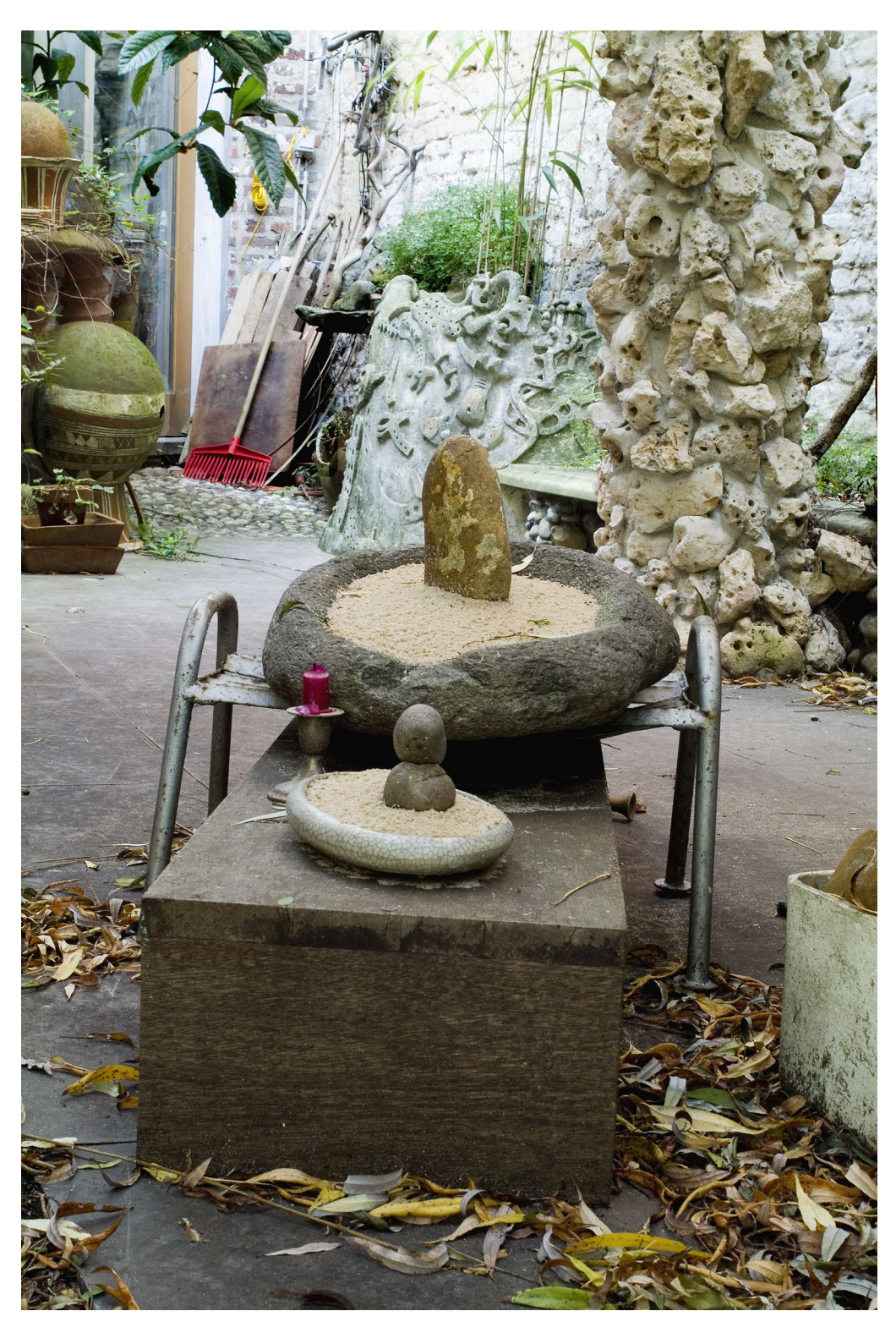
A secret garden for Ghent 2006 Diverse objects in a Zen arrangement Variable dimentions View of the work at private home in Ghent, Belgium