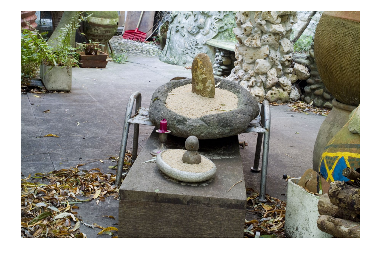
A secret garden for Ghent 2006 Diverse objects in a Zen arrangement Variable dimentions View of the work at private home in Ghent, Belgium