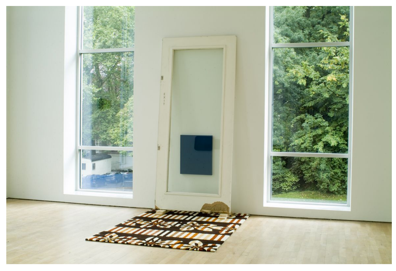
Exit 2006 Museum door with carpet and monochrome painting Variable dimentions View of the work at Stedelijk Museum voor Aktuele Kunst (City-Scan) Ghent, Belgium