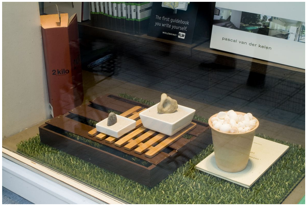
Le Déjeuner sur l'herbe, Japanese version 2006 Portable Zen garden with diverse objects 40 x 60 x10 cm Details of the work at Copyright Bookshop Ghent, Belgium