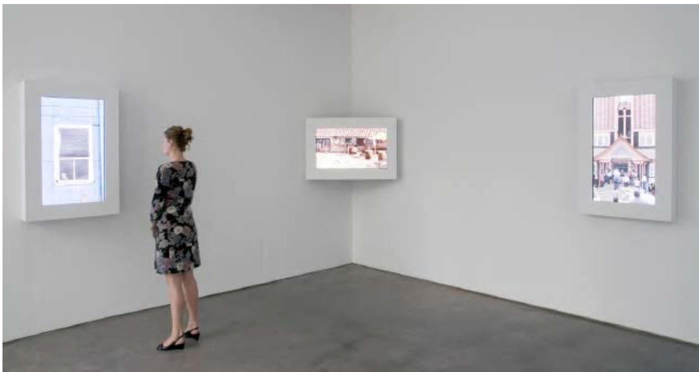
ALMOST ROMANTIC curated by Christopher Eamon. I-20 Gallery. NYC. 2010

LA FENETRE HDV. 14 min. Color. Silent. Loop. 2008.