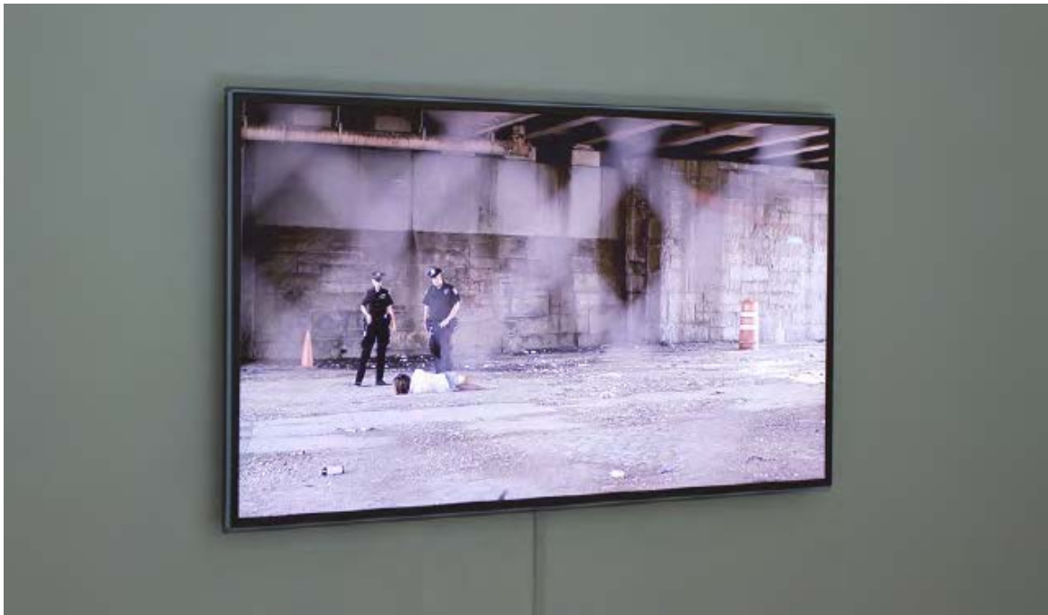
1065591 HD. 6 min. Color. Silent. Loop. 2011.