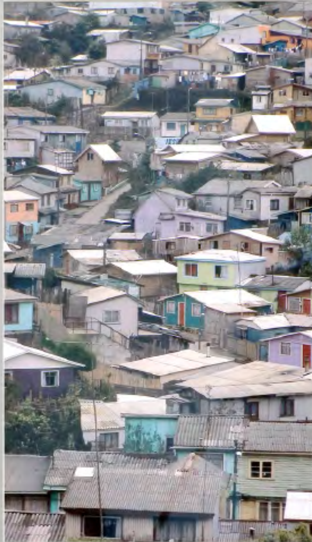
LOTA HDV. 13 min. Color. Silent. Loop. 2010.

ANTOLOGIA VISUAL DE JOVENES FOTOGRAFOS: Chile 2010-2011 curated by Montserrat Rojas Corradi. Contemporary Art Museum. Santiago. Chile. 2011.