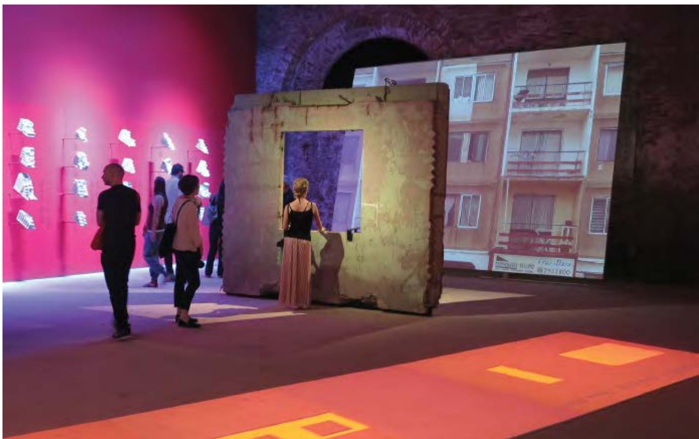
MONOLITH CONTROVERSIES - Chilean pavilion. 14th International Architecture Exhibition - La Biennale di Venezia.Venice. 2014.

KPD #1 / #2 / #3 / #4 . HD. 40 min. Color. Silent. Loop. 2014