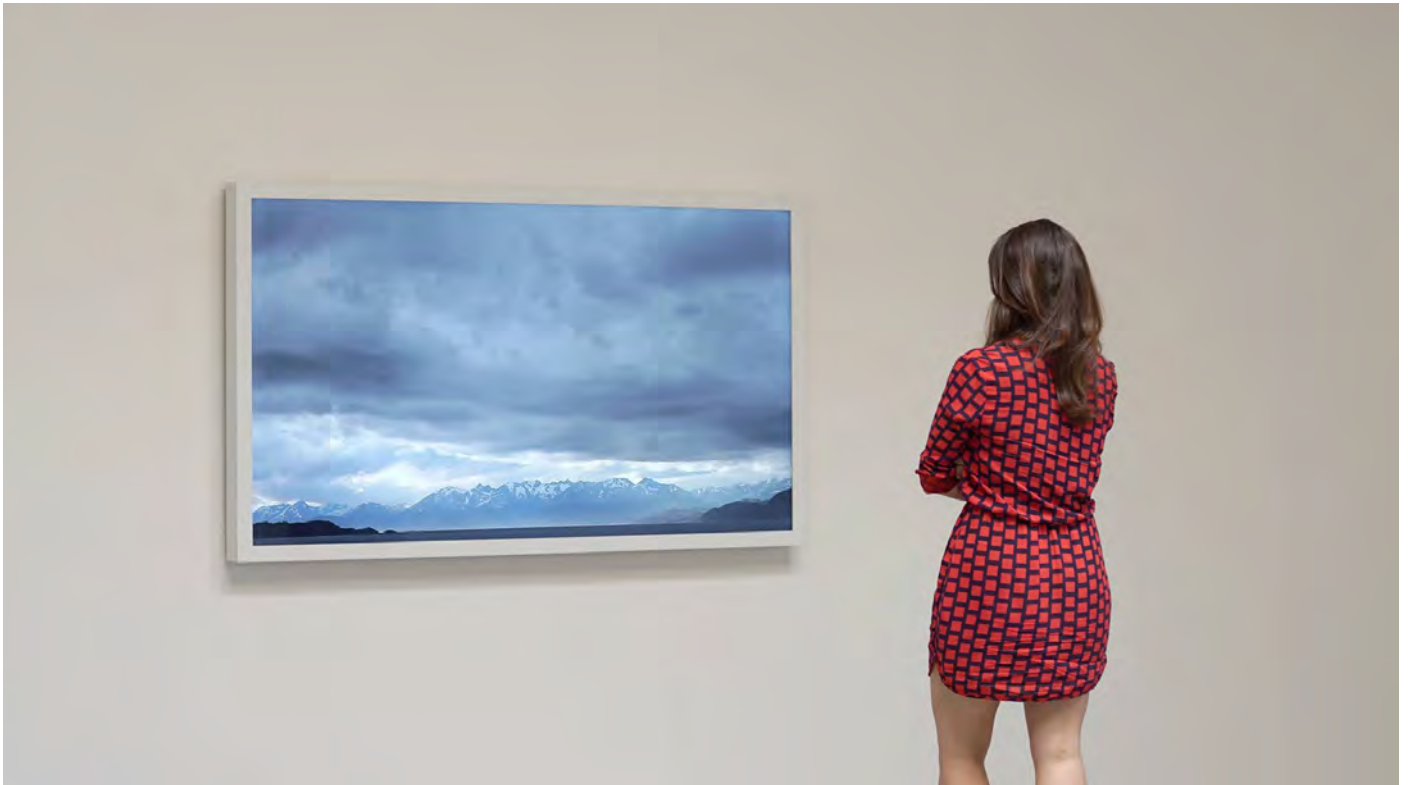
ECLIPSE: here & now Christopher Grimes Gallery. Santa Mónica. USA. 2015