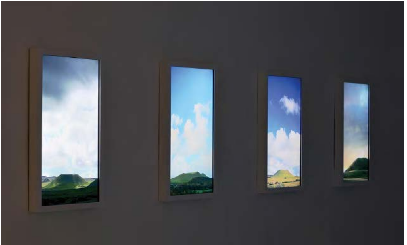
A NEW LANDSCAPE Galeria Leyendecker. Santa Cruz de Tenerife. Spain. 2013.

A NEW LANDSCAPE #4 HD. 14 min. Color. Silent. Loop. 2013.