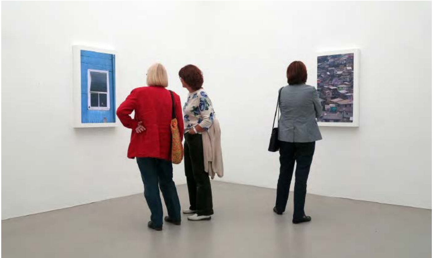
IM OBERLICHTRAUM Galerie Michael Sturm. Stuttgart. Germany. 2012.