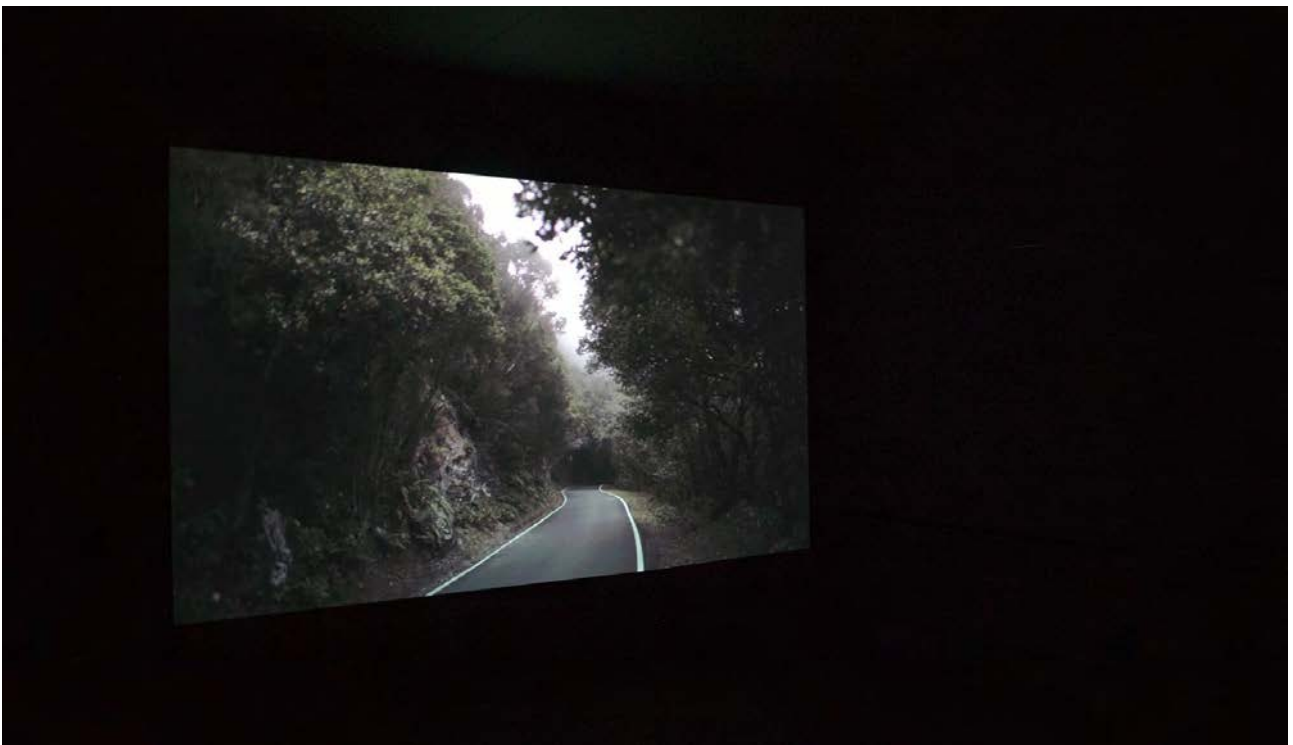
ESPIRITU SANTO #1 HD projection on wall. 5 min. Color. Silent. Loop. 2013